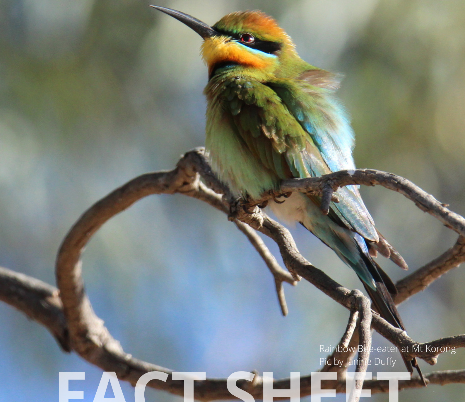
Rainbow Bee-eater at Mt Korong